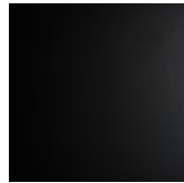
OP17 matt black