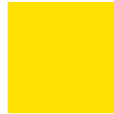
OP86 matt yellow